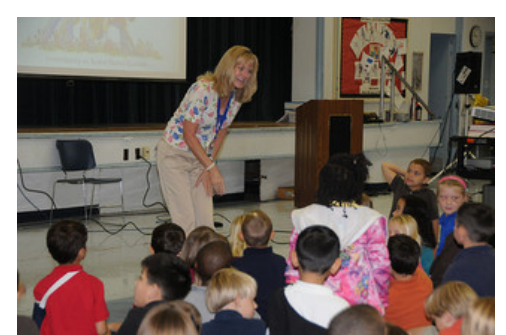
No teacher has ever summoned his or her class to the rug with the promise that "today is the day we will learn to listen and read to analyze and evaluate experiences, ideas, information. and issues from a variety of perspectives. Won't that be fun bovs and girls?!"